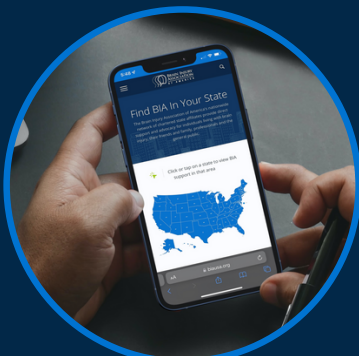
State Brain Injury Association

It is important to stay connected and refrain from isolating. If you have not found a support group, check for one that is affiliated with the Brain Injury Association in your area, join a virtual support group, or share your story with others on BIAA's website.