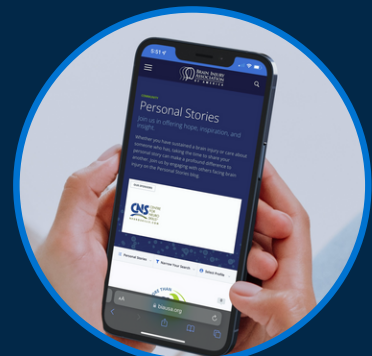
BIAA's Personal Stories