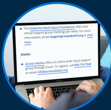
Virtual Support Groups